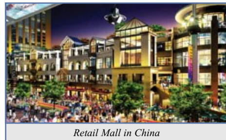
Retail Mall in China

Guangdong as well. China has a very vibrant retail market.